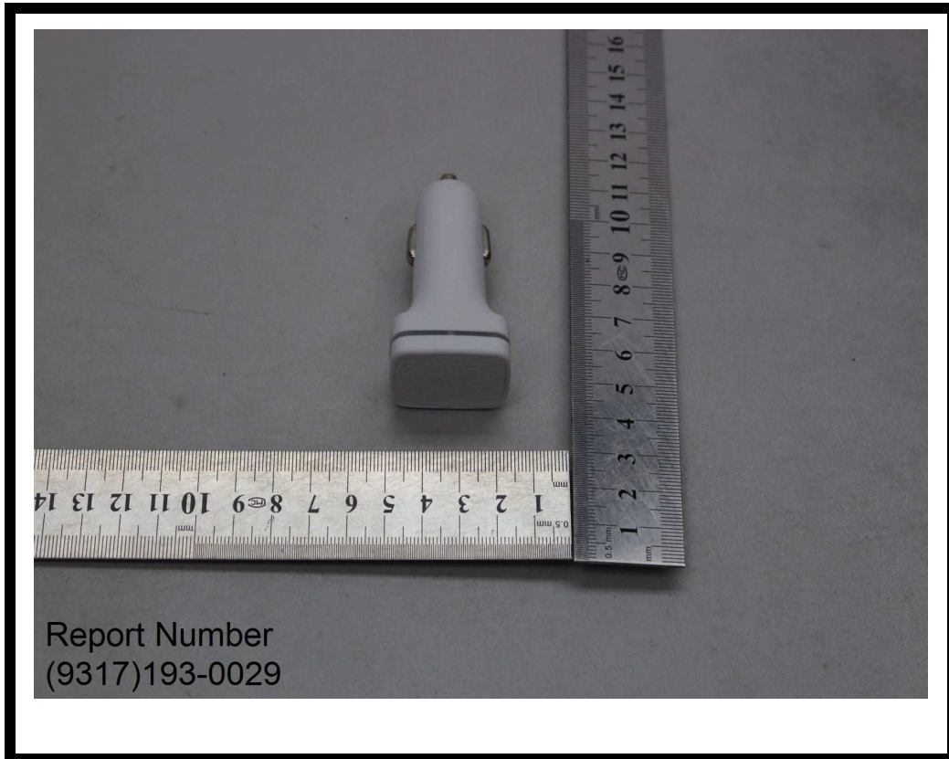
Photo of the Submitted Sample

LAB NO. : (9317)193-0029 DATE : Jul 18, 2017 PAGE : 3 OF 10